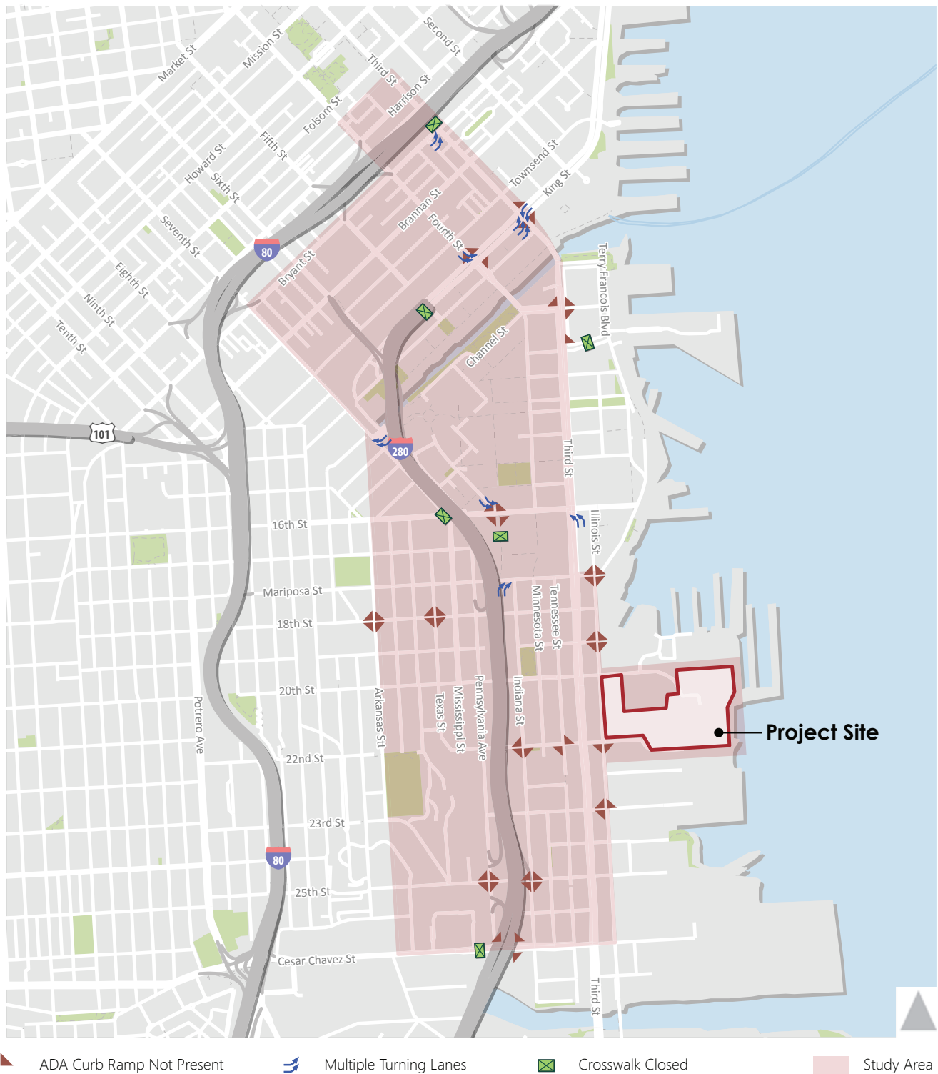
Figure 3 is an example of mapping the existing network as it relates to people walking within a project study area, with a focus on missing features for the network. Inclusion of this figure would be appropriate in the Existing Baseline section.