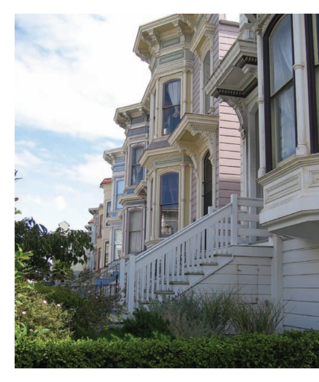
Front yard setbacks that not only enliven the public realm but also represent the historic pattern of development should be maintained and protected. When a garage is necessary, it should be inserted into the building, avoiding impacts on the characterdefining features of the building and the displacement of any ground floor residential units.