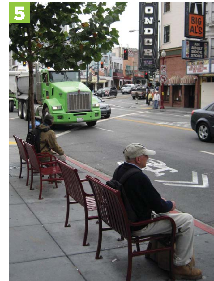
5 SIDEWALK SEATING 行人道加設座椅