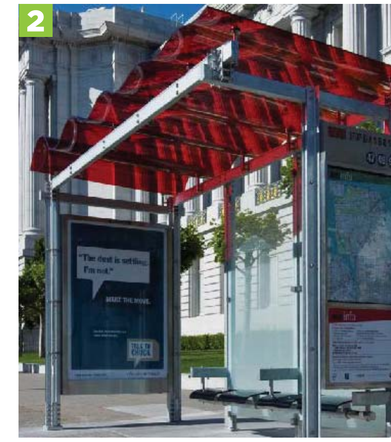
2 BUS STOP IMPROVEMENTS 加設有蓋巴士站