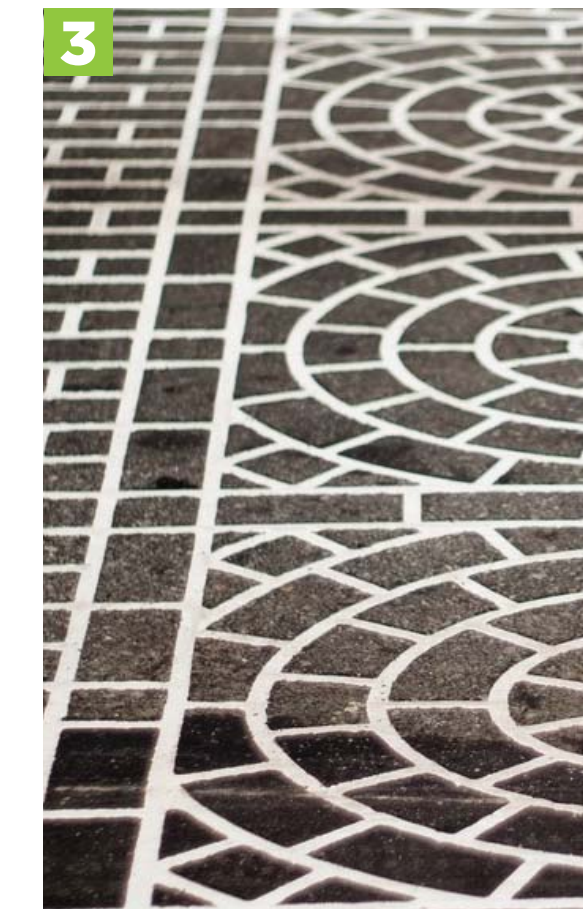
3 CROSSWALK PAVING 美化行人過街地段