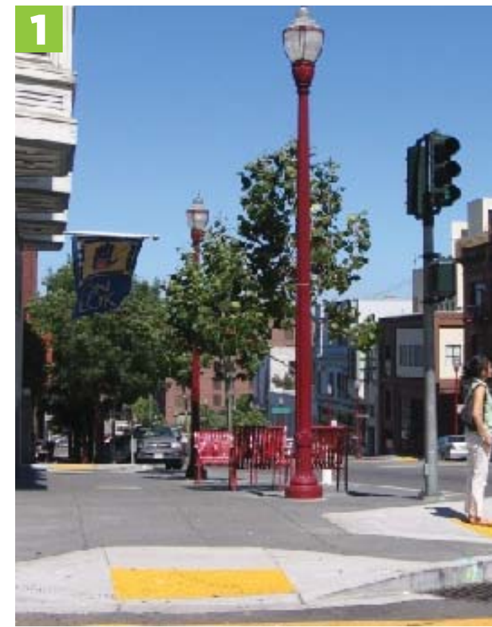
1 CORNER BULB-OUTS 加闊十字路口行人道