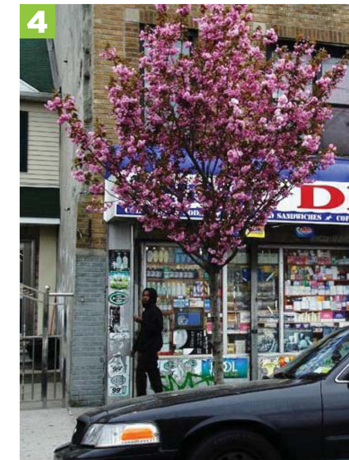
4 STREET TREES 植樹綠化行人道