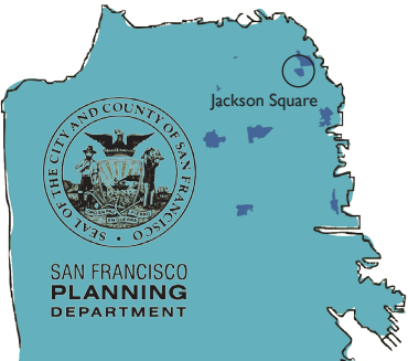
The locator map above shows the Landmark Districts found throughout the City of San Francisco.

As staff to the Historic Preservation Commission, the Planning Department's preservation planners work with property owners, city departments, and the general public to promote the preservation of these resources through incentives, long-range preservation planning efforts, public outreach, and technical assistance.