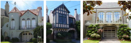
Rousseaus' Boulevard Tract Landmark District