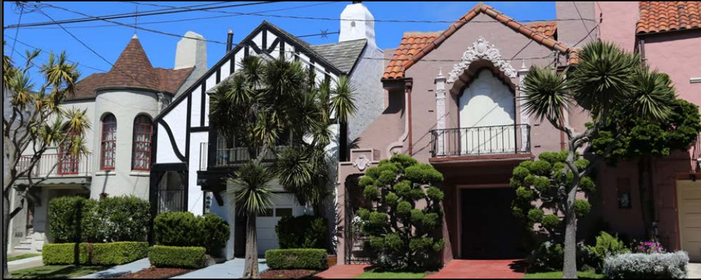
Exterior elevations and rooflines