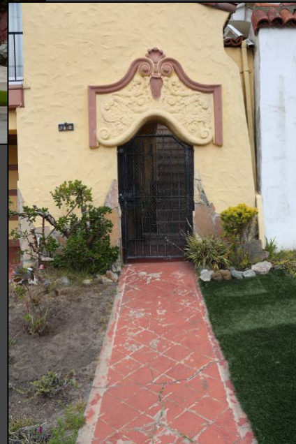
Diamond shaped scored walkway