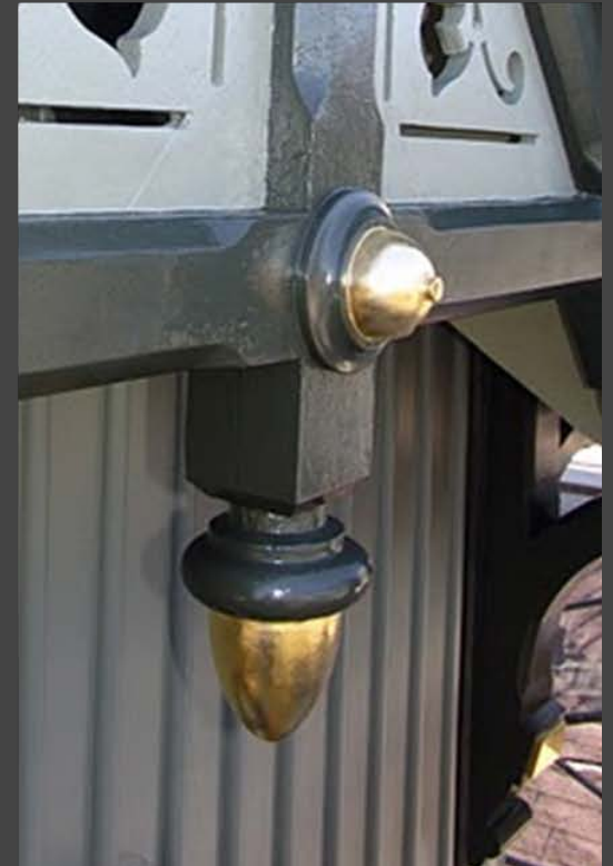
Distinctive features are preserved