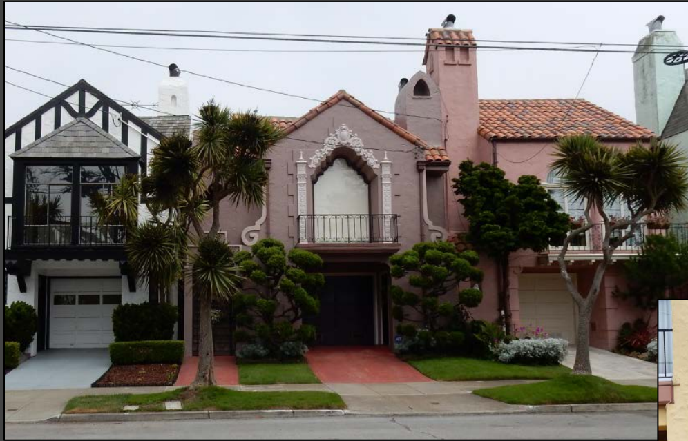
Front yard divided by a walkway and a driveway