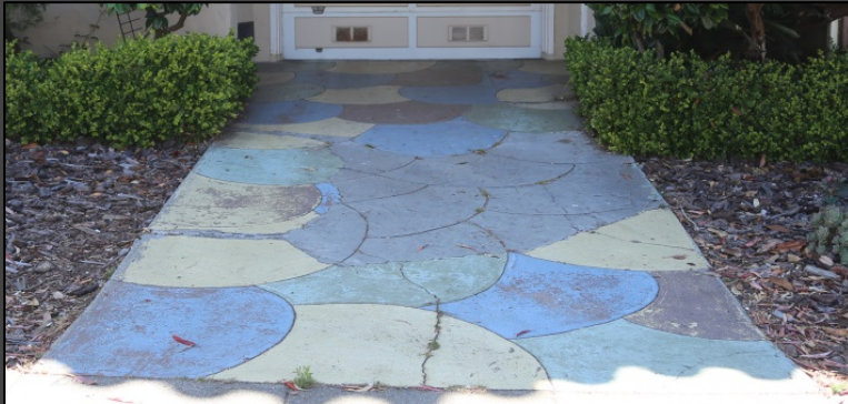
Scale shaped scored driveway