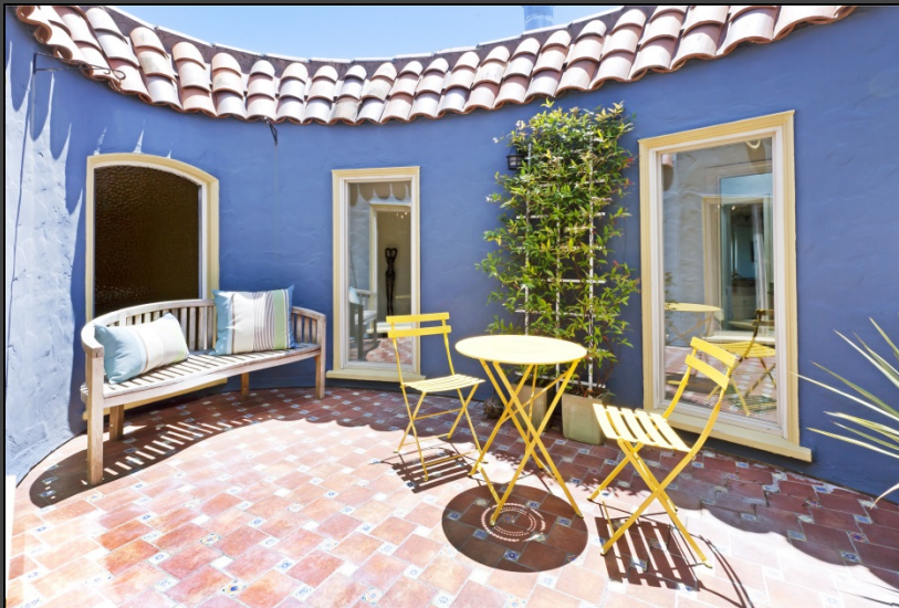
Interior open patio