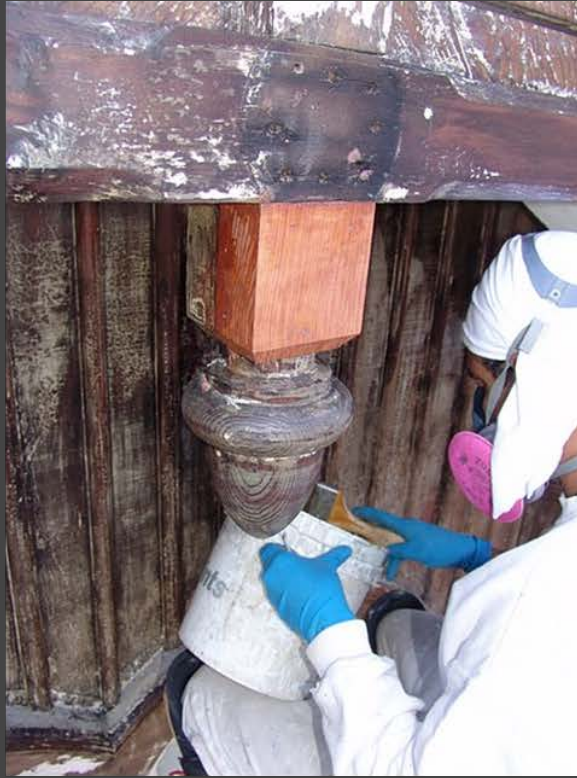
Replace with compatible materials