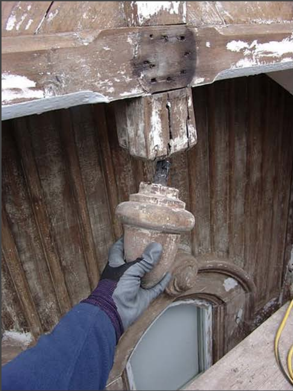
Retain and repair historic materials