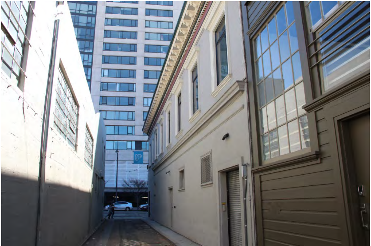
Clyde Street, view southeast. 228-248 Townsend Street is to the right.