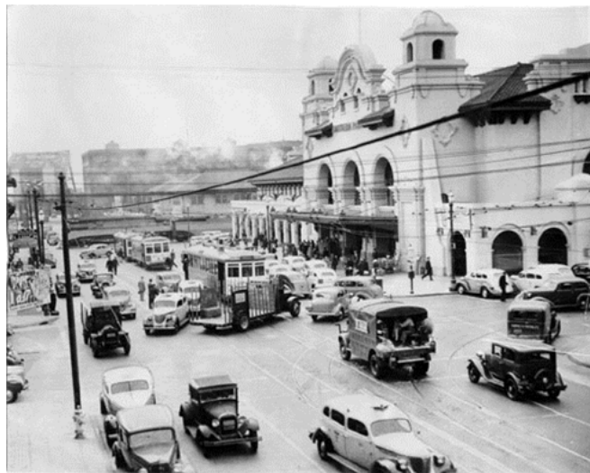
Southern Pacific Depot, 3 rd and Townsend Streets, June 16, 1939