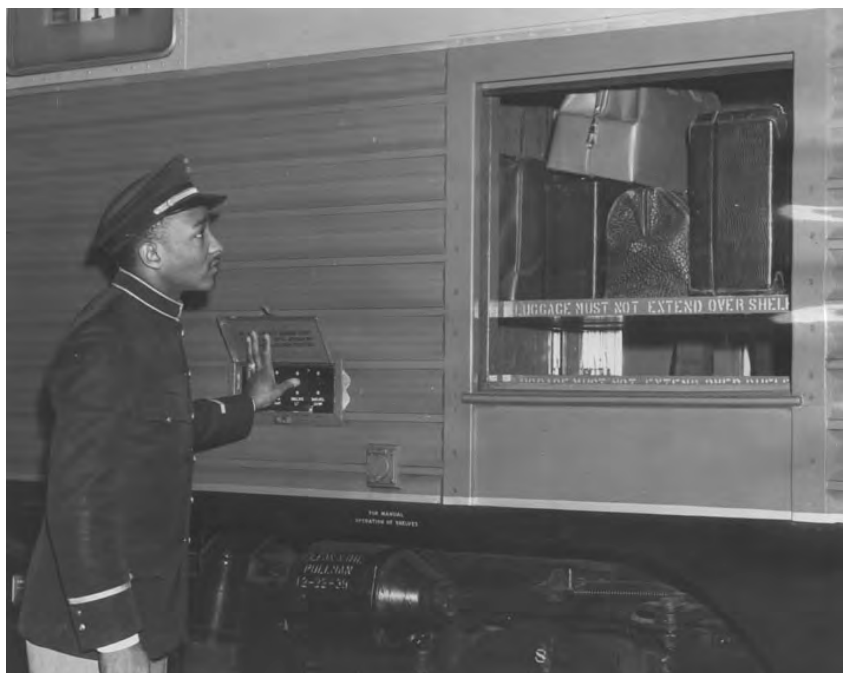
A chair car porter working on the Coast Daylight, circa 1937