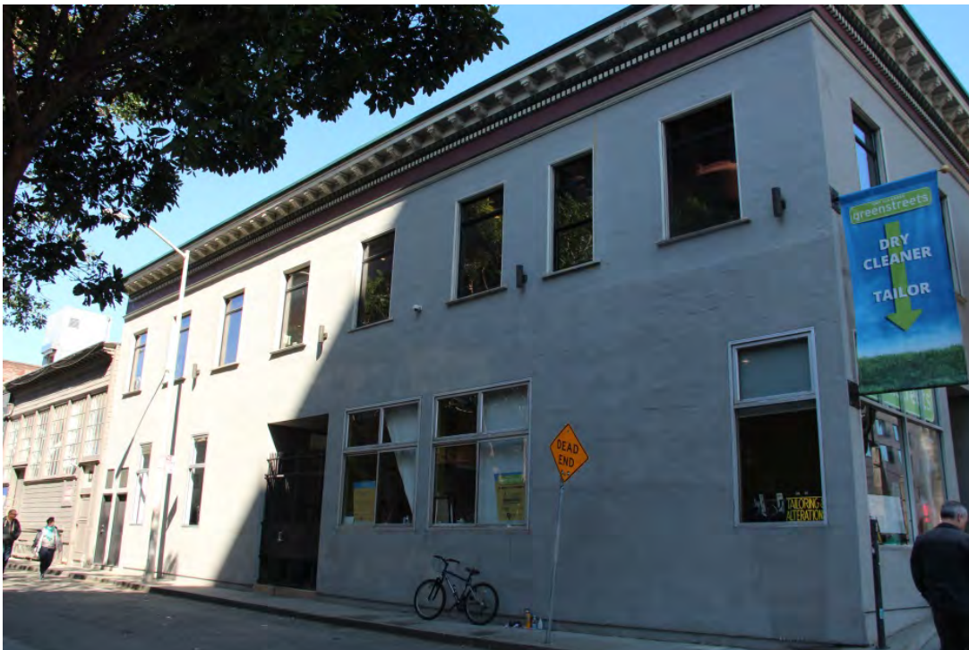
Secondary elevation (Lust Street), view north.