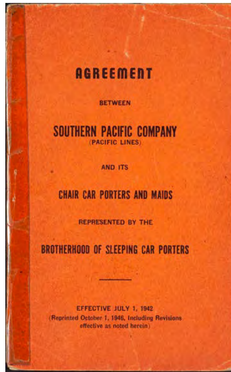
Left: Agreement between Southern Pacific and its chair car porters and maids represented by the Brotherhood of Sleeping Car Porters