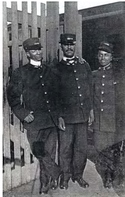
Left: Maids at work in the Bay Area (Oakland Public Library, African American Museum and Library at Oakland) Right: Pullman porters posing for a photo (California Railroad Museum)