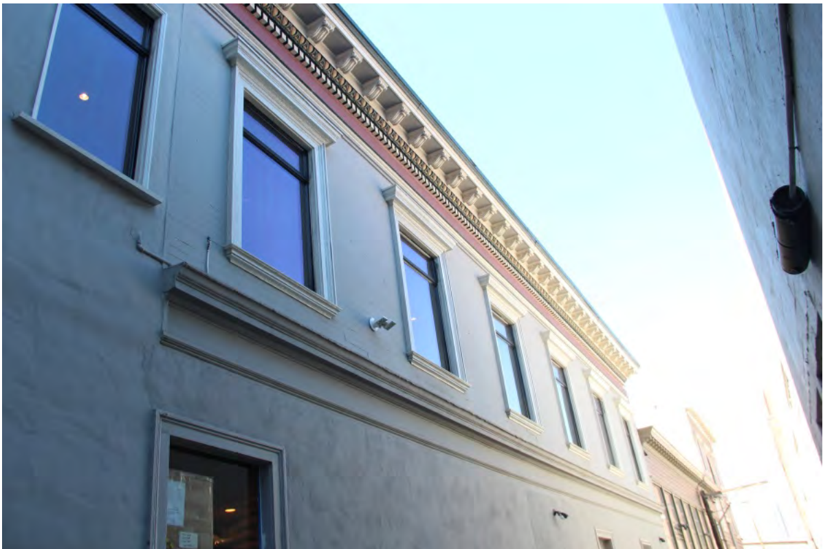
Secondary (Clyde Street) elevation, view west.