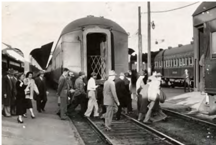
Commuters crossing railroad track at Southern Pacific Depot, March 14, 1951