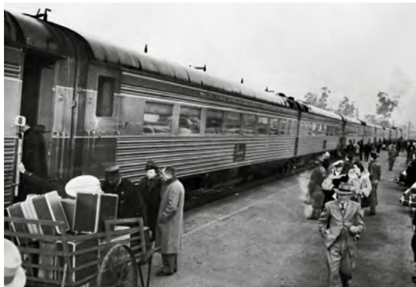
A porter assists passengers of the Coast Daylight heading to San Francisco from Glendale, California, circa 1940

By the 1950s, the railroad industry began to decline and in 1969, the Pullman Company ceased operations. In 1978 the BSCP merged with the Brotherhood of Railway Clerks, known today as the Transportation Communication International Union.