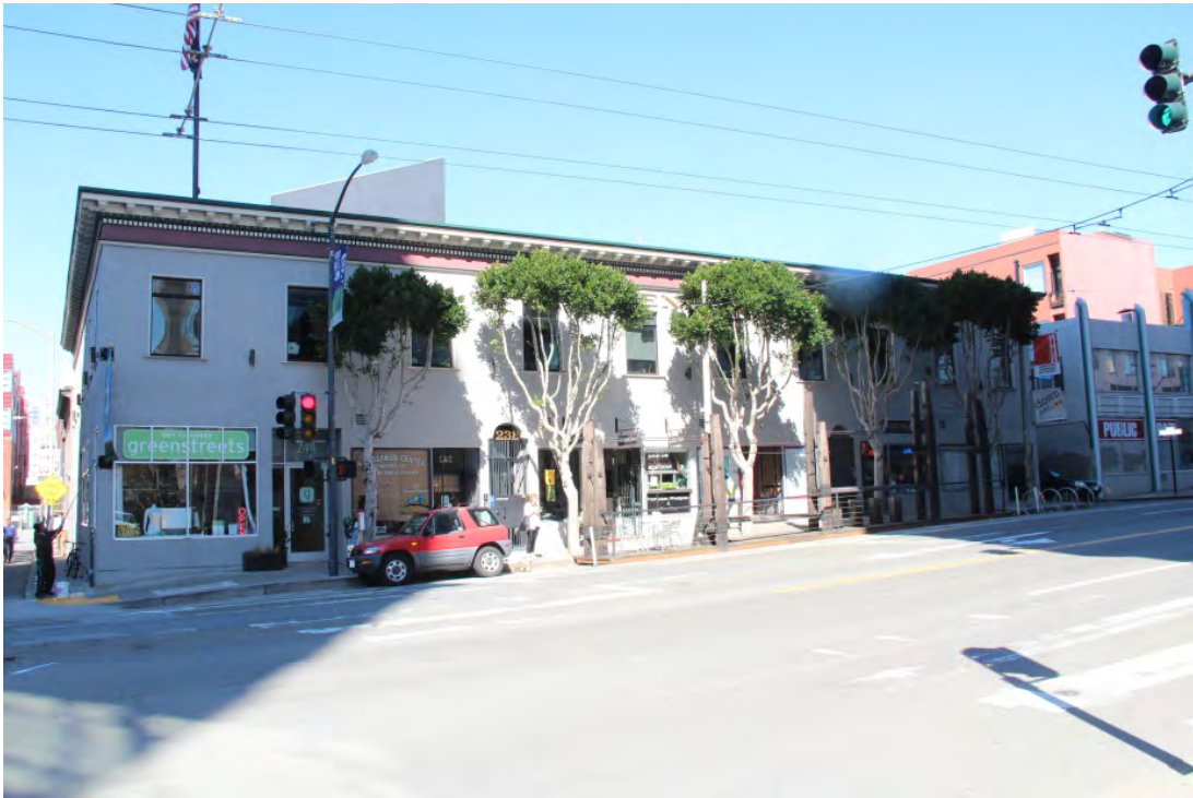
Primary elevation, view northwest.