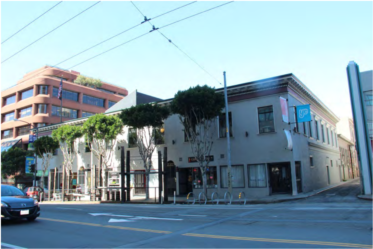
Primary elevation, view west.