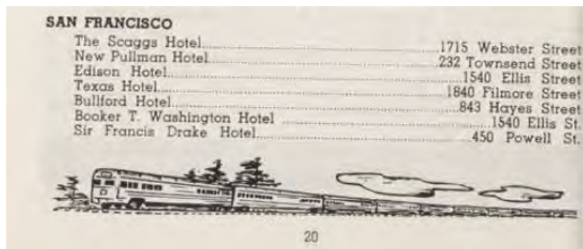
San Francisco hotel listings in the 1961 edition of The Negro Travelers' Green Book

In addition to hotels and motels, The Green Book listed private homes that were safe and open to African American travelers. These homes were referred to in the guidebook as “Tourist Homes.” The earliest listings for recommended lodging venues in San Francisco were mostly private residences, but a handful of hotels were added to the list over the years. This included the New Pullman Hotel, which was listed beginning in 1950 through The Green Book ’s last publication in 1966, two years following the passage of the Civil Rights Act. 36