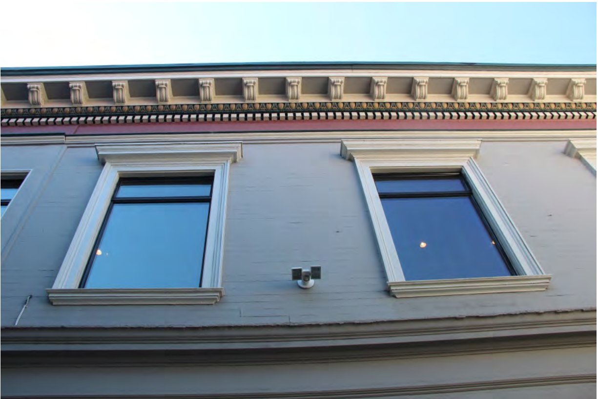
Window detail on Clyde Street elevation, view west.