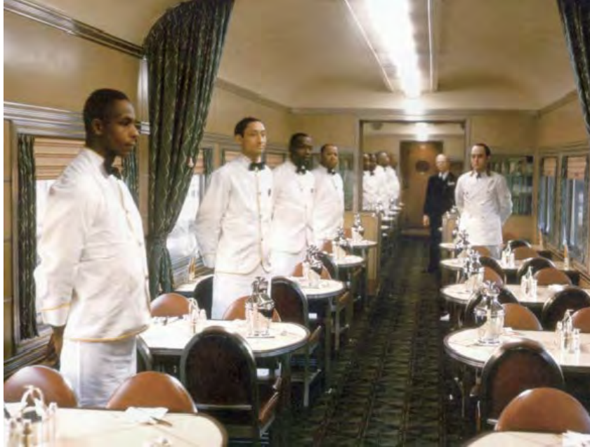
Dining car stewards and waiters in the Coffee Shop Car of the Coast Daylight, a Southern Pacific train that ran between San Francisco and Los Angeles from 1937 to 1971, circa 1940