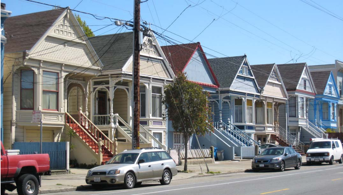
East side of Harrison Street between 21 st and 22 nd Streets.

Boundaries: East side of Harrison Street between 21 st and 22 nd Streets