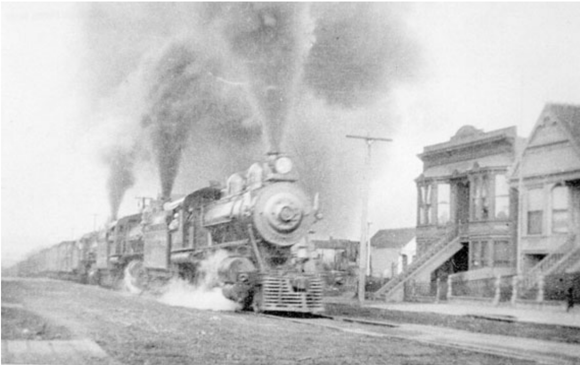
East side of Harrison Street between 21 st and 22 nd Streets, 1905. Northernmost Olsen cottage is visible at far right.

In the 1850s and early 1860s, the historic district area was occupied by the Union Race Course. The half-mile racetrack was renovated in 1862 and renamed the Willows Trotting Park, but the increasing value of land in the Mission District proved more valuable than spectator ticket fees, and the final race was run on July 18, 1863. By 1864, the San Francisco-San Jose Railroad ran through the former racetrack on Harrison Street. Although the surrounding blocks developed into one of the Mission's earliest residential suburbs, spurred on by the extension of horse-drawn streetcar lines on Folsom and Howard Streets, the subject block and others like it along the railroad route of Harrison Street were slow to build out.