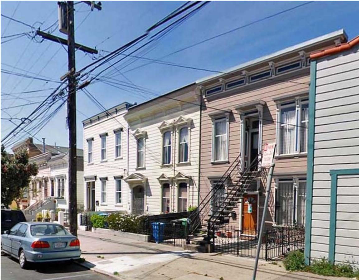
East side of Hampshire Street between 20 th and 21 st Streets.

Boundaries: Hampshire Street between 20 th and 21 st Streets.