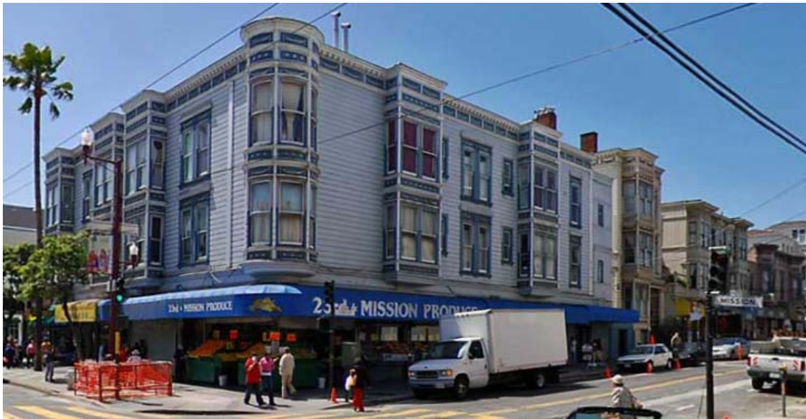
South side of 23 rd Street, west from Mission Street.

During the period of U.S. pioneer settlement, the district area lay in the western portion of the Broderick Estate, a tract of land that likely belonged to the estate of Senator David Broderick. Broderick had owned the nearby Union Race Course until his death in a pistol duel at Lake Merced in 1859. In the 1860s and 1870s, as the Mission District began to develop as a streetcar suburb, Mission and Valencia Streets became parallel, north-south transportation and commercial corridors for the urbanizing valley. Blocks along the east-west numbered streets that ran between these major commercial corridors typically developed a mixed-use character as well.