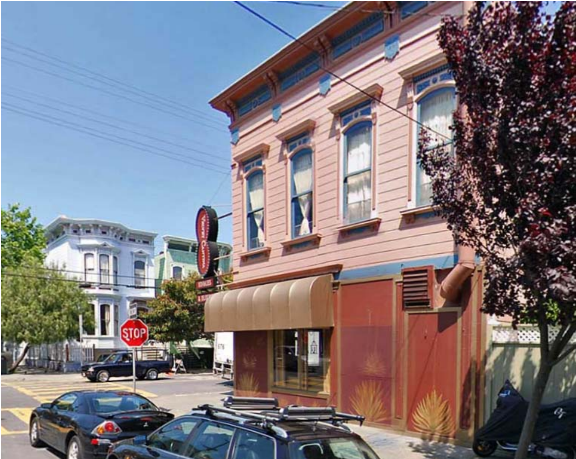
Corner of 23 rd and Bartlett Streets.

Boundaries: 23 rd Street between Mission and Valencia Streets, as well as properties on Mission, Bartlett, and Valencia Streets