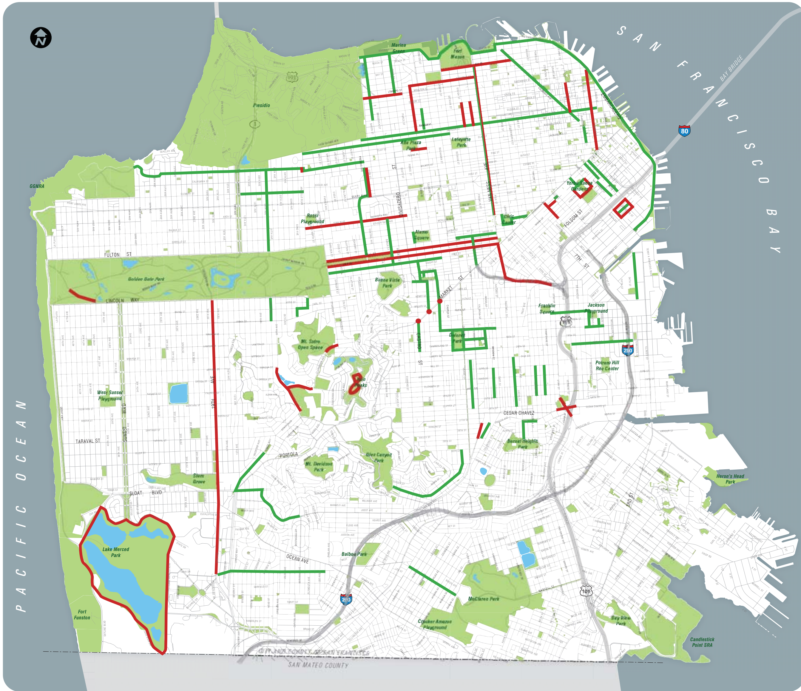
Parks & Routes Year 1 Outreach Summary — Favorite Routes — Least Favorite Routes

In July, Walk San Francisco hosted a pedestrian charrette. Walk SF board members, pedestrian planners and city staff were invited to provide feedback on how to could create a network of great walking connections to parks , open space and the waterfront. The map below summarizes the ideas and feedback from the charrette.