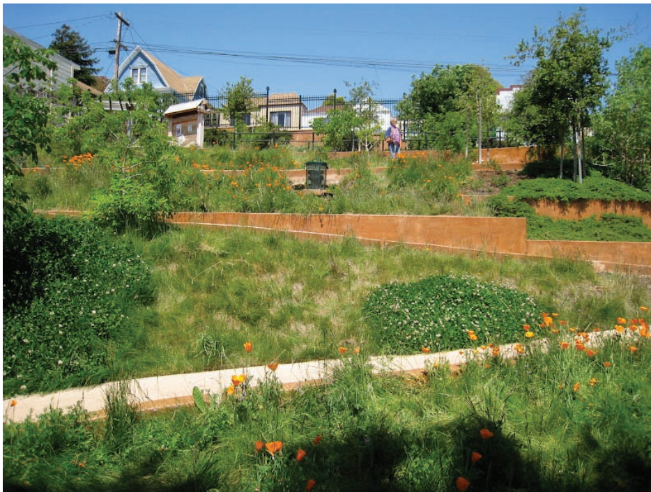
Visitacion Valley Greenway