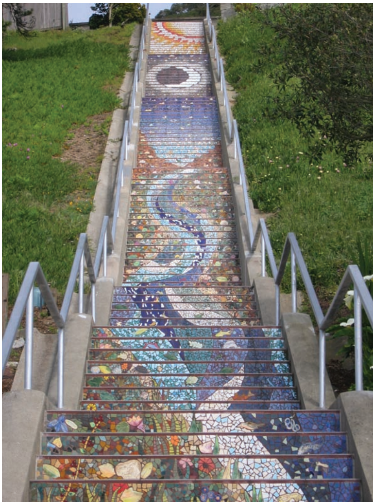
Moraga Street Steps