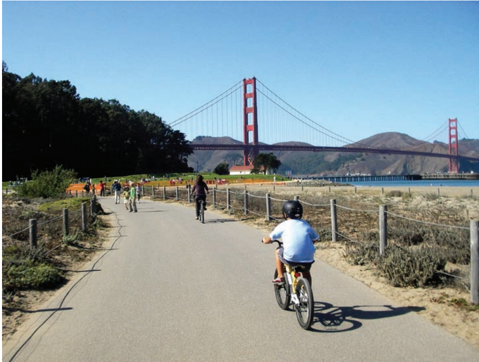
Presidio, Crissy Fields