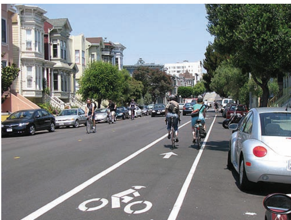
The Wiggle, Scott Street