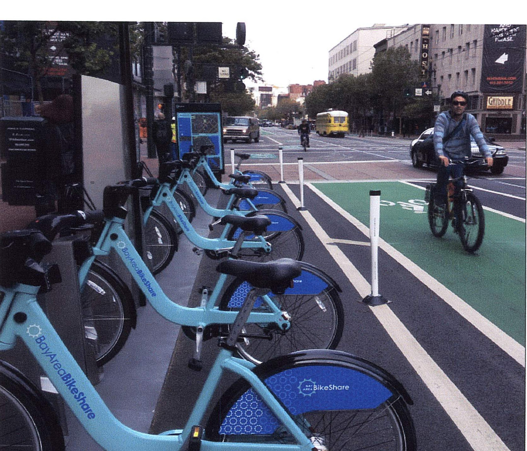
Bicycle Share Stations