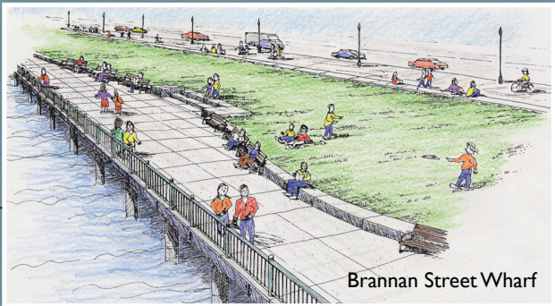
Brannan Street Wharf