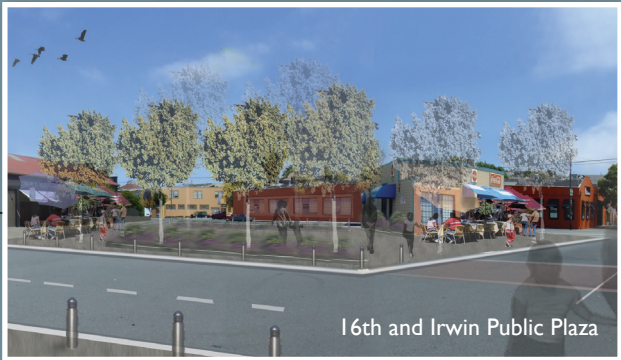
16th and Irwin Public Plaza