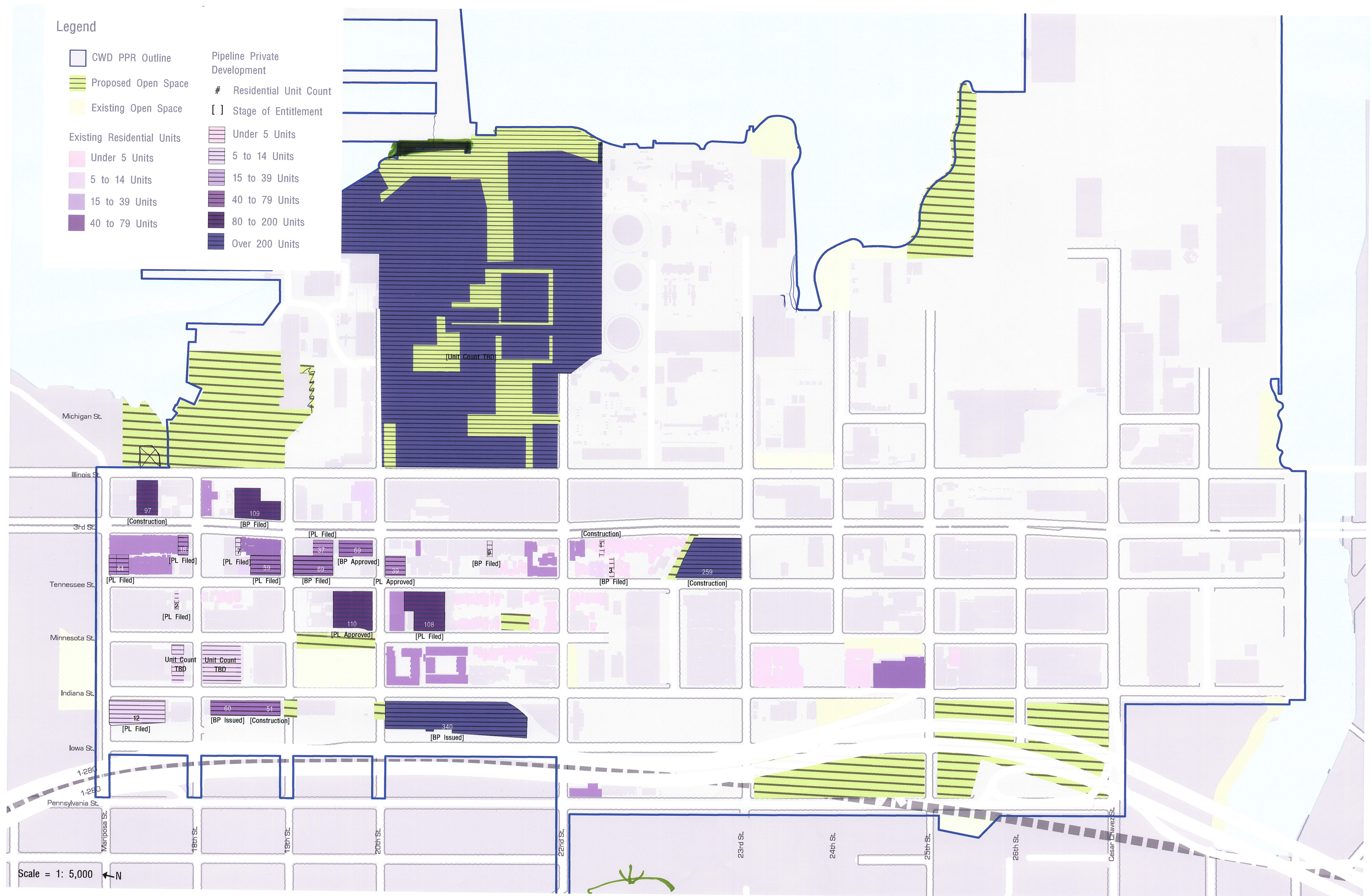
EXISTING AND PROPOSED RESIDENTIAL DEVELOPMENT