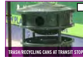
TRASH/RECYCLING CANS AT TRANSIT STOPS