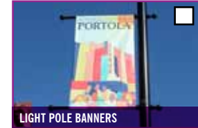
LIGHT POLE BANNERS