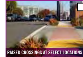
RAISED CROSSINGS AT SELECT LOCATIONS