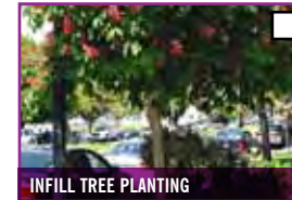
INFILL TREE PLANTING