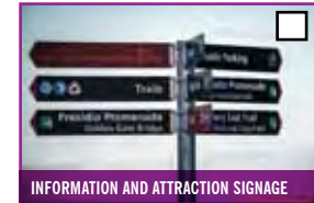
INFORMATION AND ATTRACTION SIGNAGE