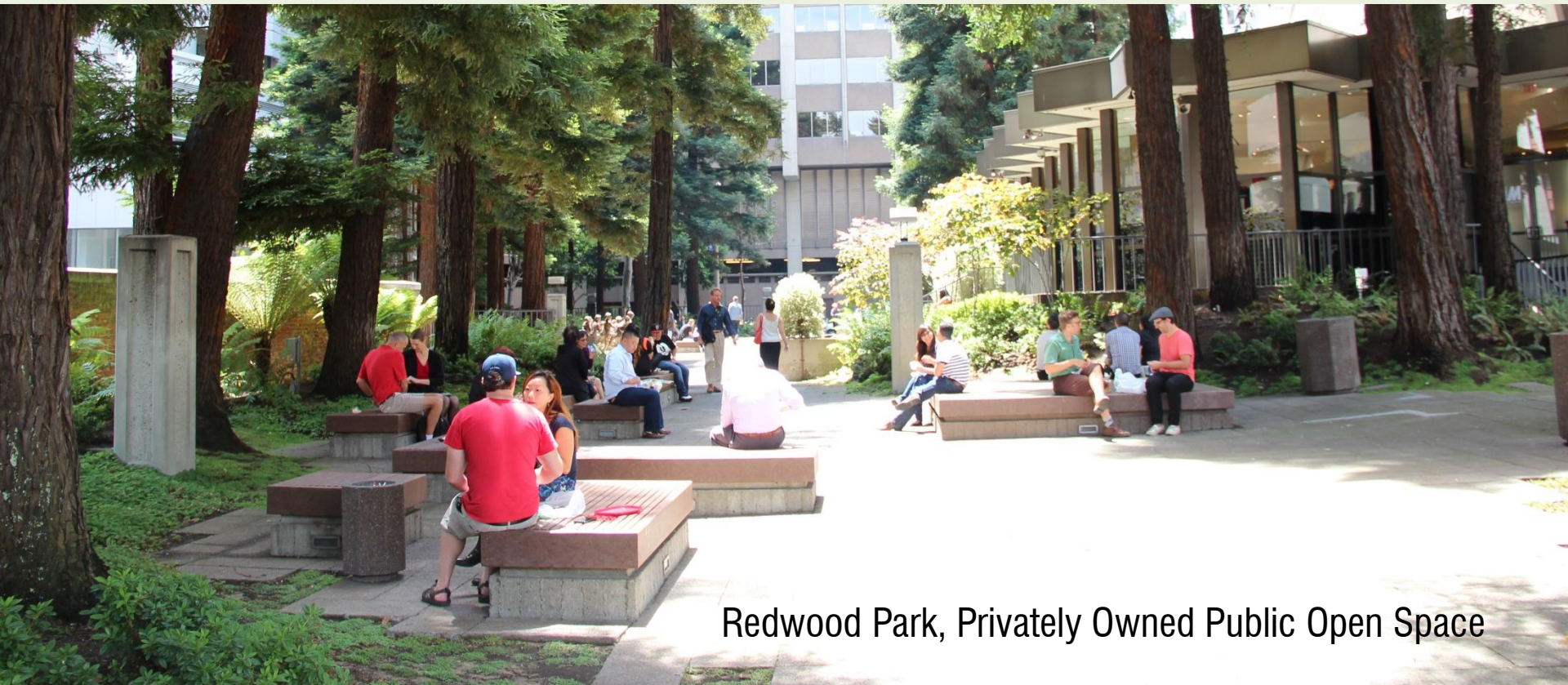
Redwood Park, Privately Owned Public Open Space

Privately owned public spaces should read as part of an overall, coordinated pattern of open space. Require generous minimum amounts of private open space.