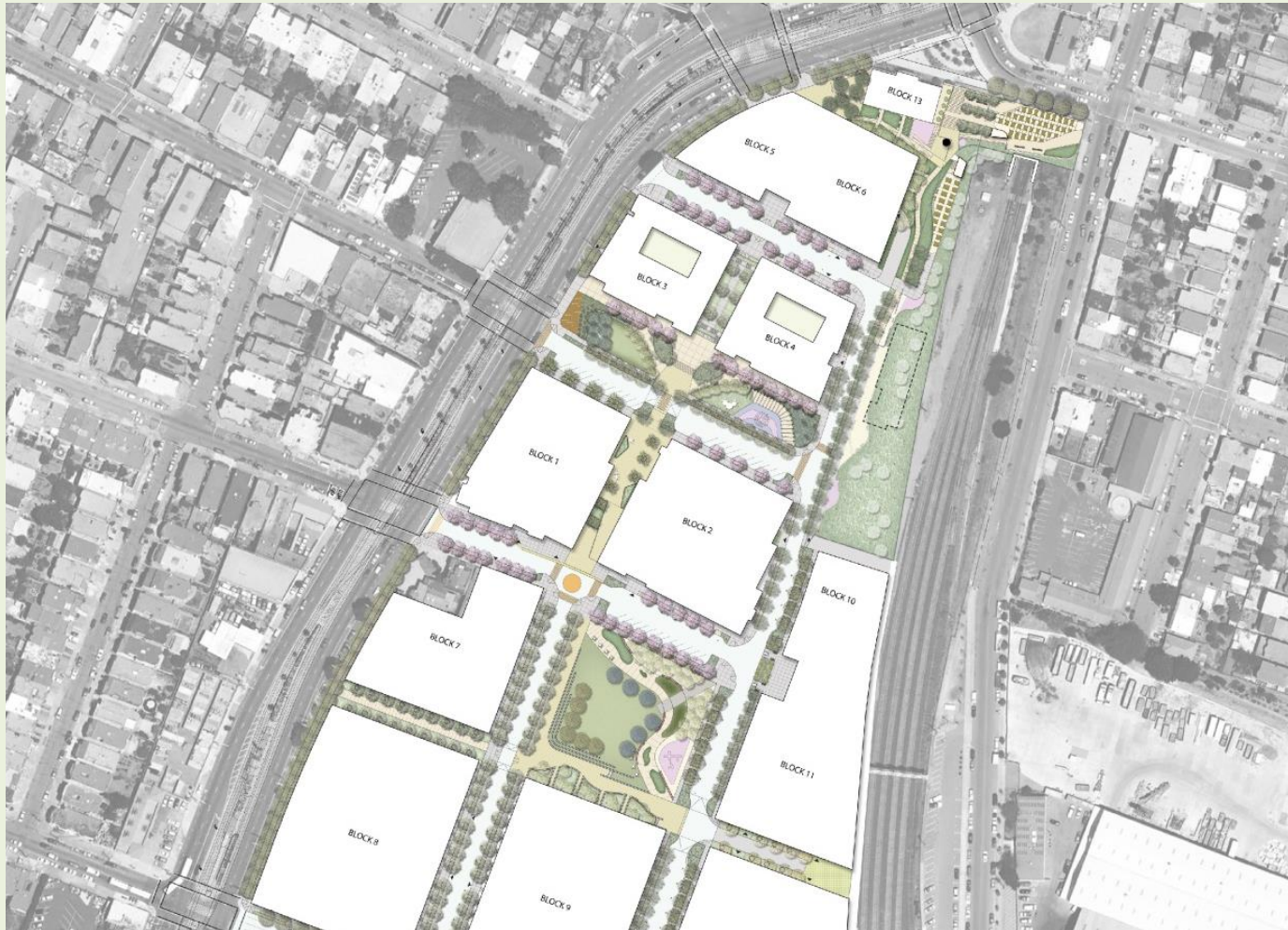
Schlage Lock Site Plan