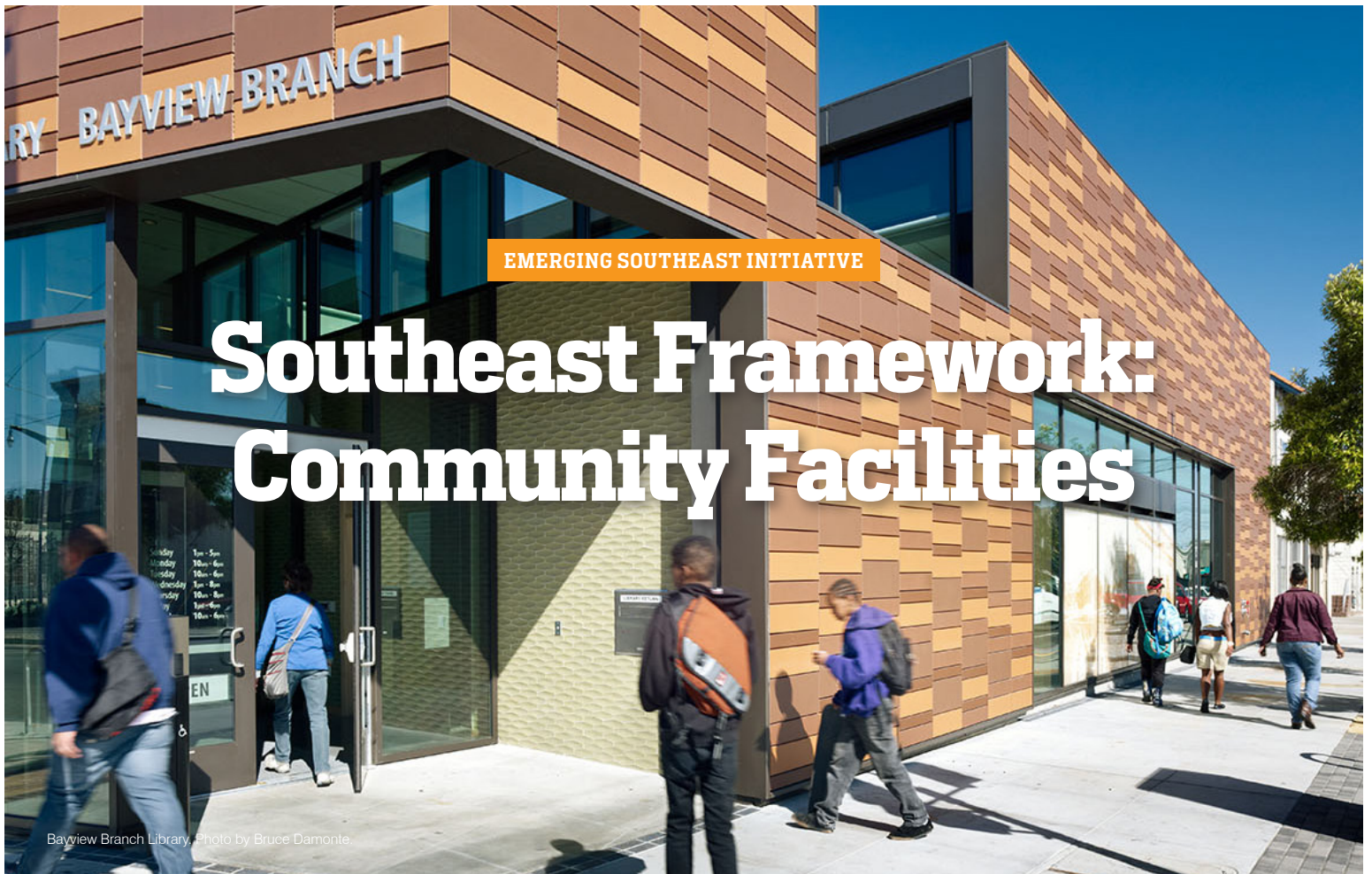
Bayview Branch Library.