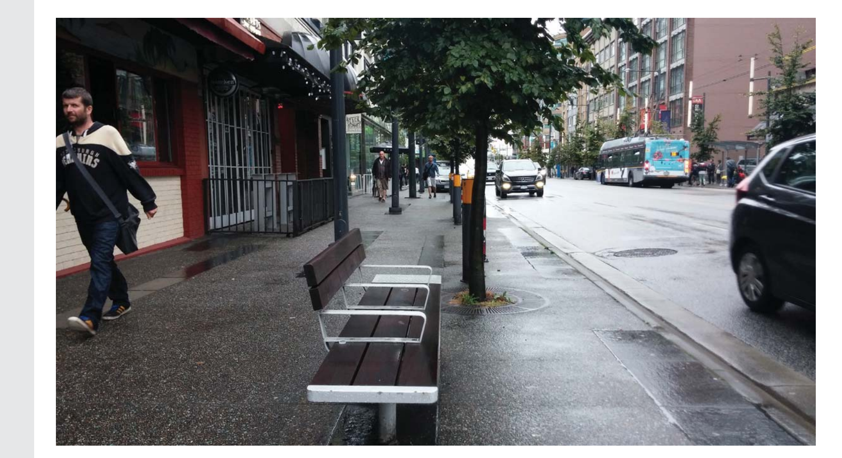
Castro Street | Mountain view, C