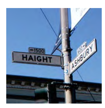
IDENTITY Haight Ashbury is a distinct

The neighborhood's streets should be a place that both residents and tourists can enjoy.