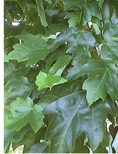
Acer rubrum 'Armstrong' (Armstrong Maple)