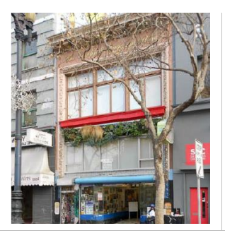
James G. Walker Building,

In the past two years, 99 buildings were designated as individual landmarks or as landmark district properties. An additional 32 buildings were designated as significant or contributory under Article 11.