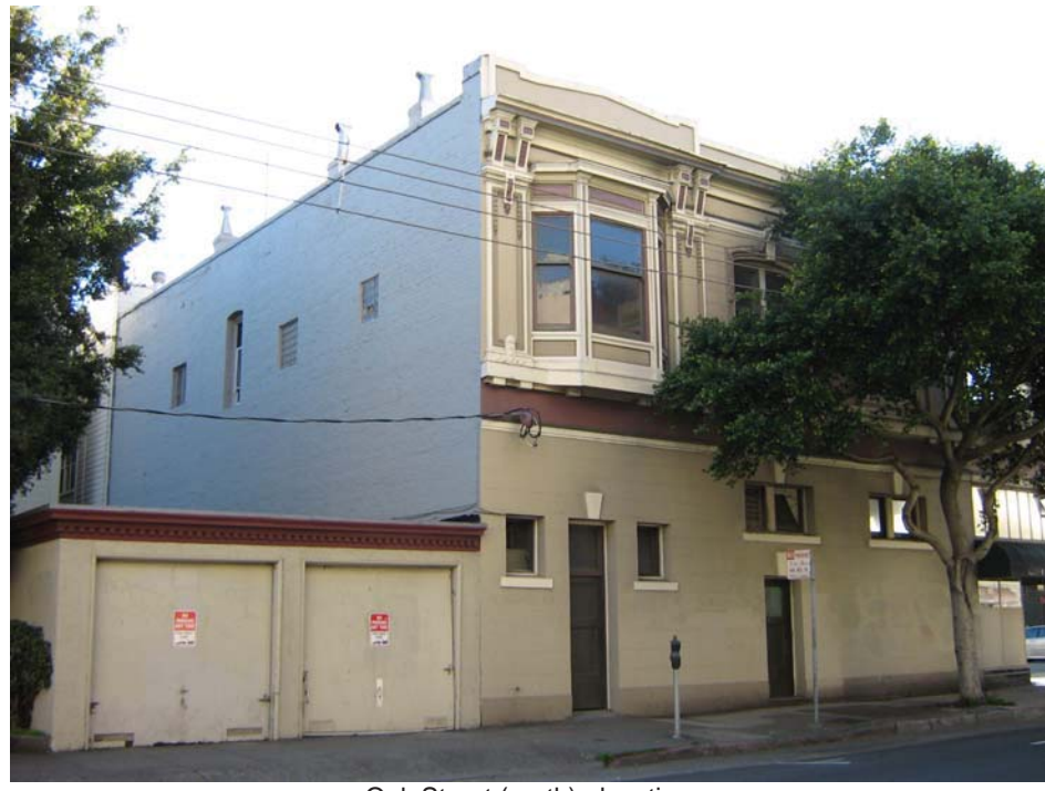
Oak Street (north) elevation

garland at the top of the paneling. The center bays contain paired, double-hung, wood sash, keystones, and garlands outlining the top of the surround. The façade terminates in a projecting cornice with paired brackets framing the end bays. A sign centered on the frieze reads "R. L. Goldberg Building." A parapet wall rises above the cornice line and has shaped parapets with end piers above the end bays. The Oak Street elevation is 3 bays wide. The first story features an asymmetrically divided fixed wood sash with keystone set high on the wall in the first bay. The second bay features a secondary entrance with glazed wood door and keystone in the second bay under an identical window. The third bay features another secondary entrance with a flat lintel and keystone and flush wood door with a transom. The entrance is flanked by small, square, fixed wood sash. The upper story features semi-hexagonal bay windows in the first and third bay with identical sash and detailing to those on the façade. The center bay has an arched window opening with bracket keystone fitted with double-hung, wood sash. The elevation terminates in a shaped parapet wall with peaked sections with end piers over the bay windows. A single-story two-car garage with flat roof and dentil cornice is attached to the rear (east) elevation. The building appears to be in good condition.