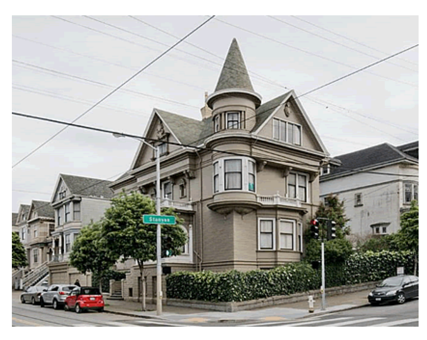
View of 199 Carl Street.

Based on initial review of historic photographs and previous survey efforts, the building may qualify for local designation as it appears architecturally significant and retains a high level of physical integrity relative to its date of construction. Additional research is needed to identify the building's architect and date of construction. The building may also qualify for designation due to its association with pioneering dairyman William Lange. Additional research is needed to document Lange's connection to the building and site, and tenure.