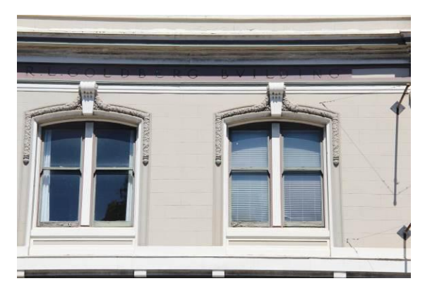
R. L. Goldberg Building, 182-198 Gough Street