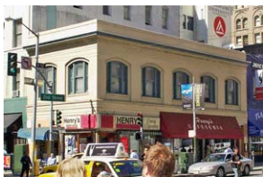
Burdette Building 90 Second Street