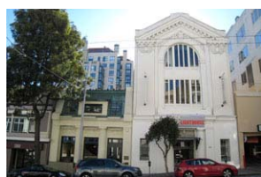
Congregation Emanuel School Buildings 1335 & 1337 Sutter Street