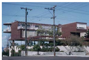
Russell House (Erich Mendelsohn) 3778 Washington Street