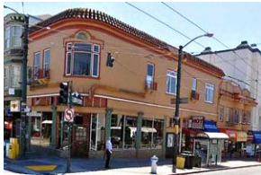
Twin Peaks Bar, 401 Castro Street

Landmark No. 265 Effective May 10, 2013 Total Hours: 123