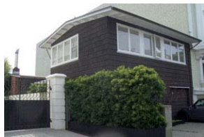
Wolski House (William Wurster) 3655 Clay Street