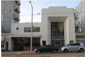
Doelger Bldg., 320-326 Judah Street

Landmark No. 265 Effective May 10, 2013 Total Hours: 123