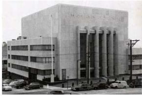
Sailors' Union of the Pacific 45 Harrison Street