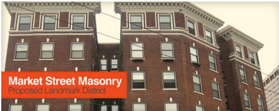
Market Street Masonry Proposed Landmark District