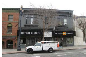
New Era Hall 2117 Market Street