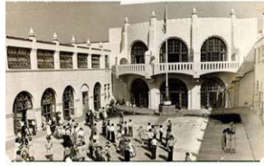
Sunshine School 2728 Bryant Street