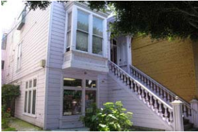
Marcus Books 1712-1714 Fillmore Street

The final quarterly report for fiscal year 2012/2013 includes hours and tasks undertaken by Planning Department staff in support of projects included on the Historic Preservation Commission’s current Landmark Designation Work Program. This quarterly report covers the period July 1, 2012 to June 30, 2013.