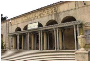
Mothers' Building San Francisco Zoo