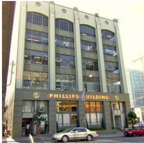
Phillips and Van Orden Building 234 First Street