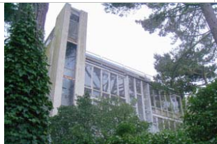
2 Clarendon (Anshen + Allen)