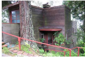
Cowell House (Morrow + Morrow) 171 San Marcos Avenue