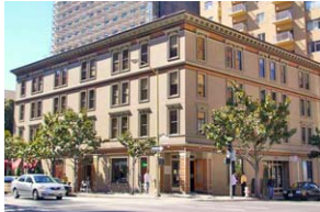
Planters Hotel 606 Folsom Street