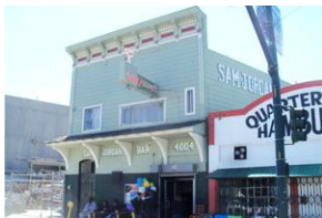
Sam Jordan's Bar, 4004 Third Street

Landmark No. 264 Effective February 6, 2013 Total Hours: 200