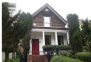
2173 15 th Street