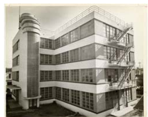
Samuel Gompers High School 106 Bartlett Street