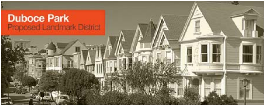
Duboce Park Proposed Landmark District

Landmark No. 263 Effective February 6, 2013 Total Hours: 126