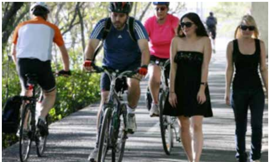
Conditions on The Embarcadero, May 2014