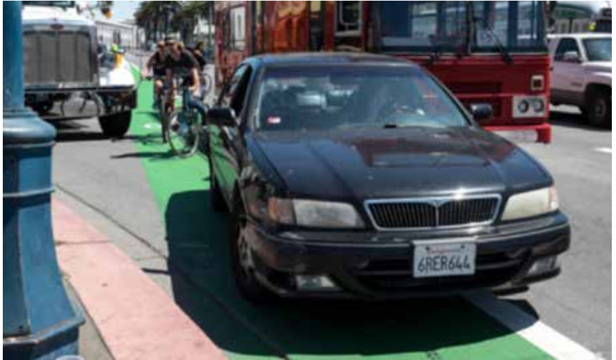
Conditions on The Embarcadero, May 2014

This project is under the purview of the Waterfront Transportation Assessment (WTA), which provides a strategic focus on coordinated transportation improvements and investments to serve current and future growth planned along the waterfront and eastern side of the City. This project is one strategy that has been identified as part of the WTA assessment which, collectively with the other identified strategies, are intended to address transportation conditions over the next 25 years along the San Francisco waterfront in anticipation of proposed major developments, including the Warriors, Mission Rock and Pier 70 projects.