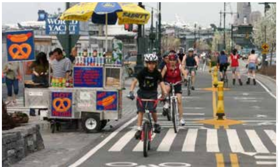
Two-Way Bikeway, New York City

Subsequent phases would include environmental review, detailed design, and construction. Currently these phases are unfunded.