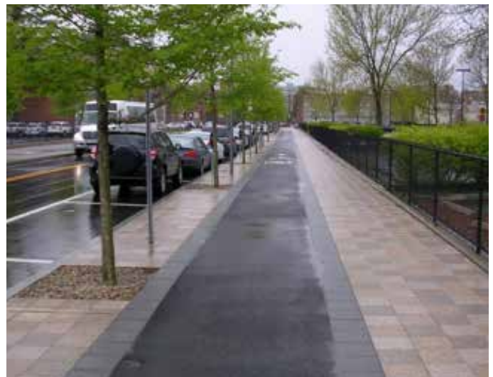
Raised Bikeway, Cambridge, MA

The popularity of the waterfront (east) side of The Embarcadero comes at the expense of the west side of the roadway, which is underutilized as a walking and biking route. Narrow sidewalks, and a large number of wide and multi-legged intersections discourage people on foot and bicycle from using the west side. Nonetheless, this project may seek to address the imbalance in safety, comfort and utilization of the two sides of The Embarcadero to help distribute some of the road users to the City side.