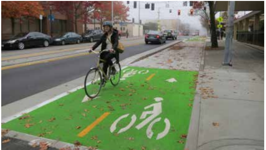
Two-Way Bikeway, Seattle, WA

As requested, members of the Project Team will have individual meetings or will give presentations about the project at neighborhood or other scheduled group meetings with sufficient advanced notice.