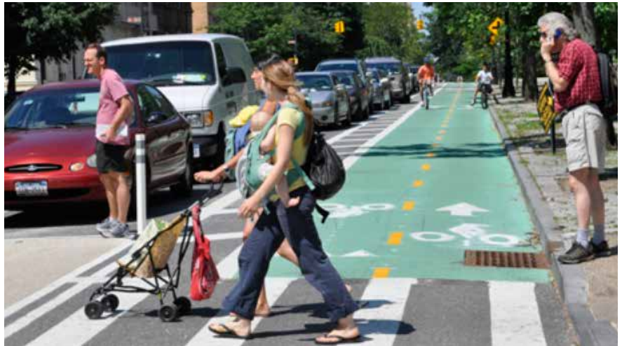
Improvements on Prospect Park West, New York NY

Travel data collected on The Embarcadero illustrate the high level of demand for walking and cycling. Data collected by Gehl Architects who helped to develop pedestrian-oriented improvement plans for Jefferson Street in Fisherman's Wharf, found that portions of The Embarcadero at Pier 39 have higher pedestrian volumes than some of the busiest pedestrian corridors in the world, including Broadway in New York, George Street in Sydney, Australia, and Regent Street in London, England.