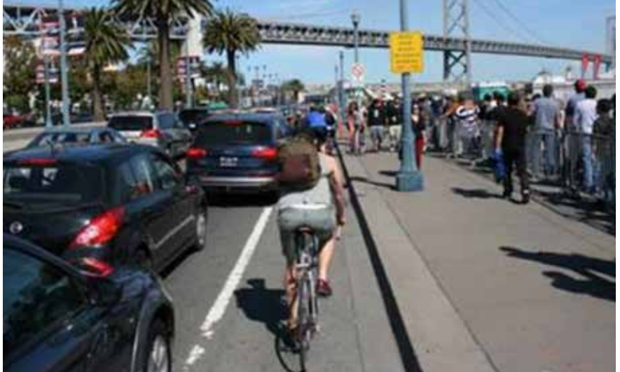
Crowded conditions on The Embarcadero indicate the level of popularity of the roadway

There is no preferred bikeway concept or design at this time. This will be developed as part of a robust outreach process over the course of the planning effort which will involve a series of one-on-one meetings with some stakeholders, presentations, public open houses and workshops. The trade-offs associated with any design option will be fully understood and communicated to stakeholders, including the public at large. Given the relatively long distance of the project limits (3-miles in length), and varying characteristics of the roadway (for example presence of on-street parking, number of travel lanes, demand for curbside activities), a range of design options may be needed at different points along the roadway.