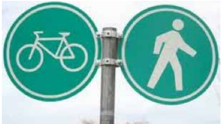
Multi-Use Path Sign, Boston, MA

The location and design of the bikeway on The Embarcadero, are unknown at this time. The constraints of the roadway, which includes the Muni right-of-way, narrow sidewalks on the west side, and the widths of the existing travel lanes, will dictate what design elements are technically feasible. Trade-offs between parking, Promenade width and travel lane width will be defined as part of the design process and the public will help to weigh-in on what they prefer.