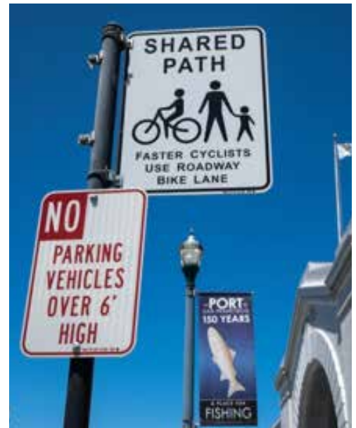
Shared Use Path Sign, The Embarcadero