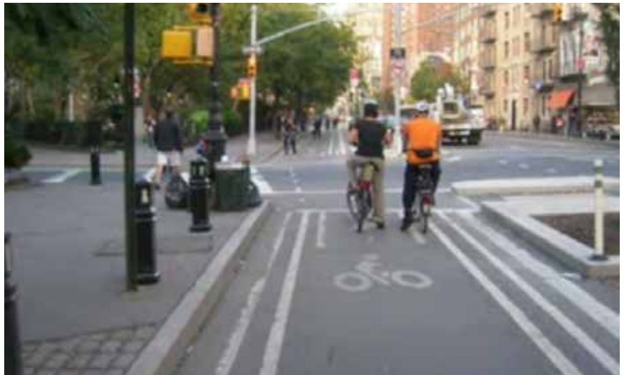
One-Way Bikeway, 8th Avenue, New York City

A bikeway, also known as a cycle track, is a physically separated bicycle facility that is distinct from both the roadway and the sidewalk. By separating cyclists from other road users, bikeways can offer a higher level of security than traditional bike lanes and attract a broader spectrum of the public, including tourists, children and less confident people on bicycles. These facilities can also increase safety and comfort for all road users by minimizing potential conflicts between those on foot, bicycle or in a vehicle, and by adding predictability to roadway operations.