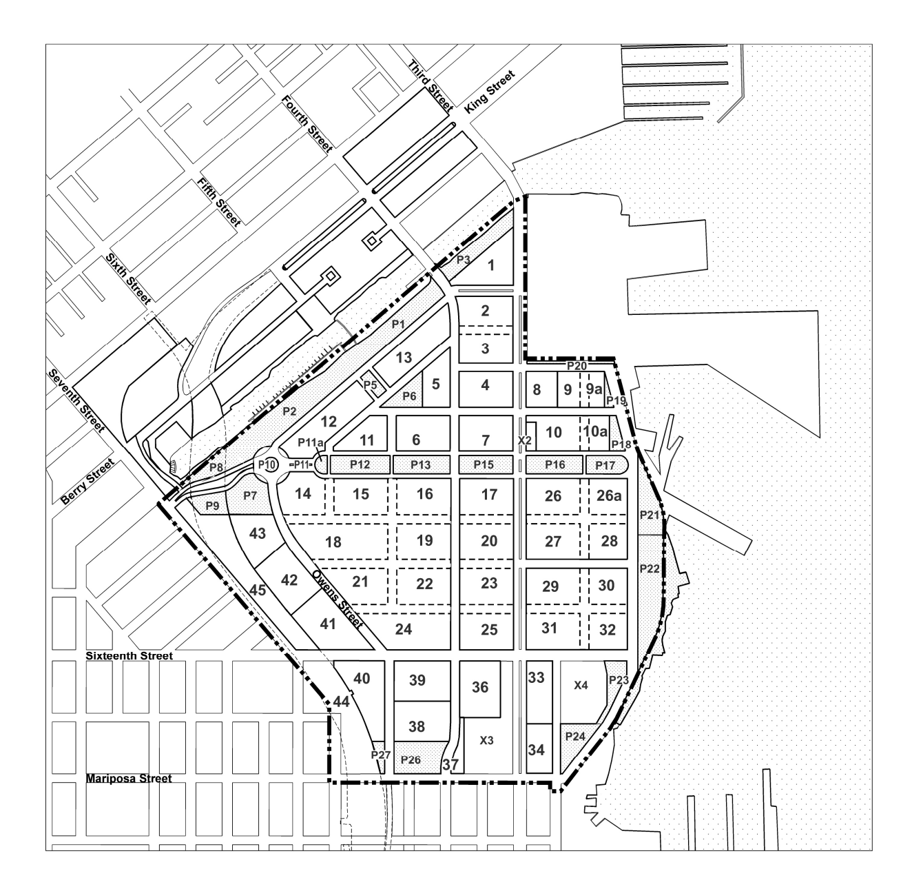
Note: Street alignments and open space configurations shown on the figure are not exact and are indicated for illustrative purposes.