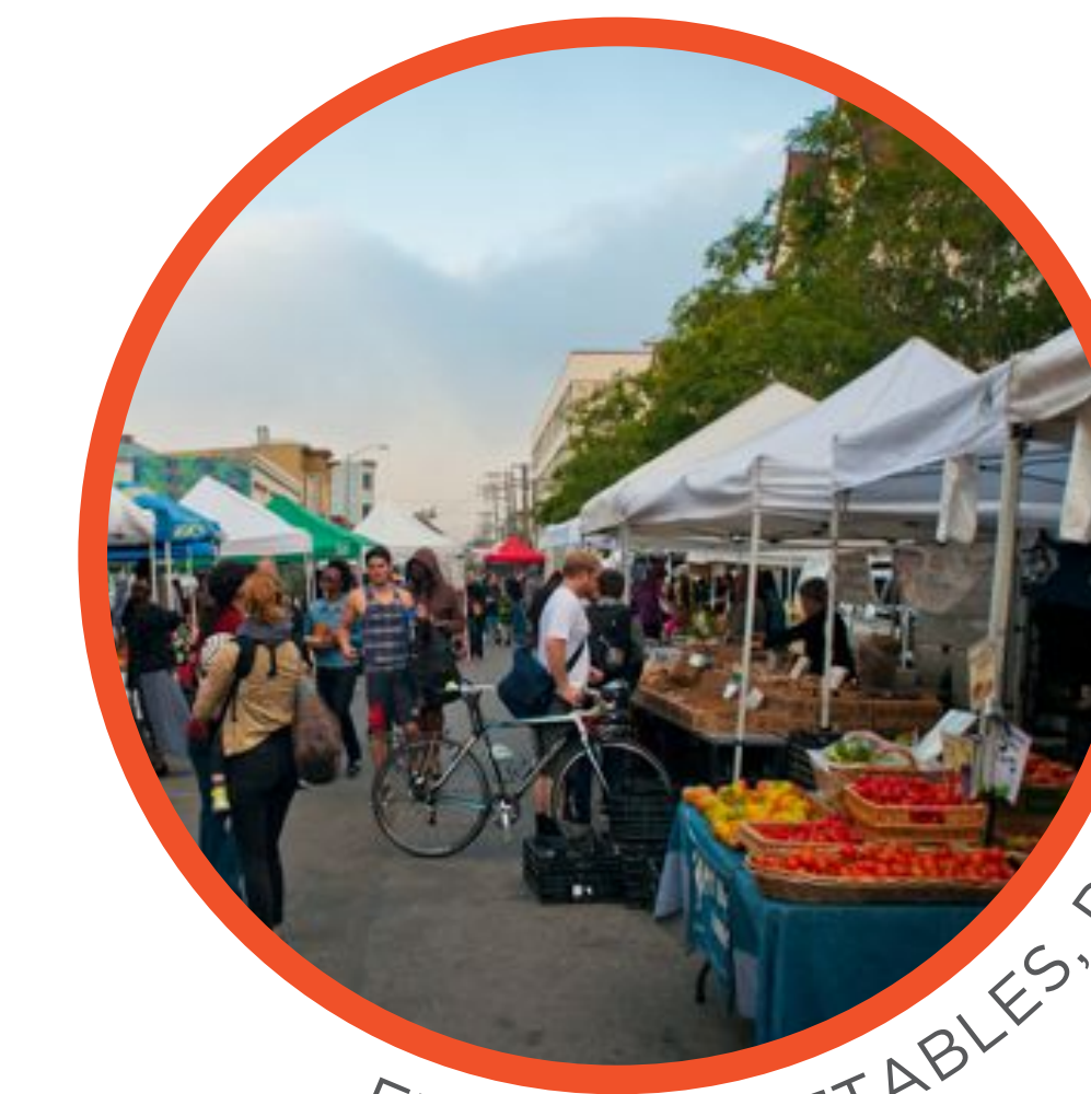
FRUITS, VEGETABLES, PREPARED FOOD