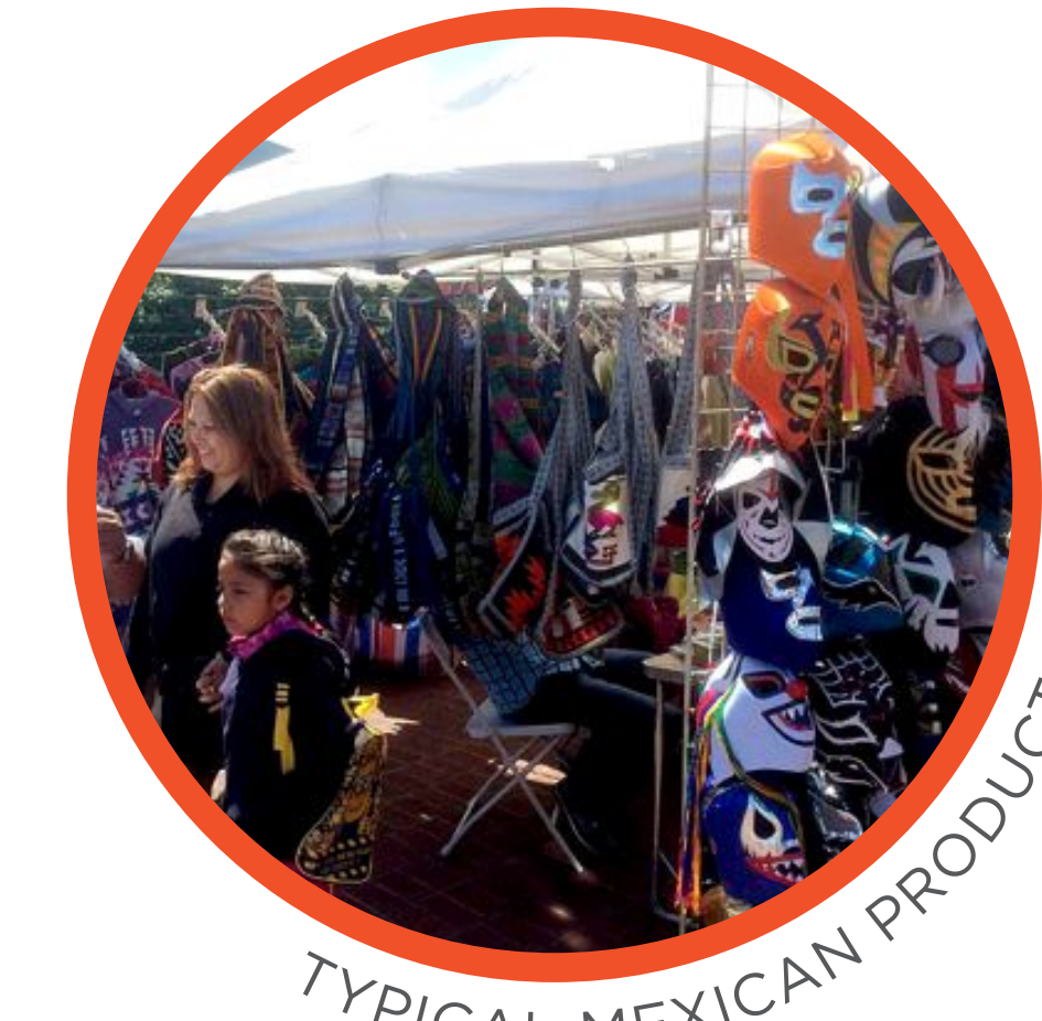
TYPICAL MEXICAN PRODUCTS