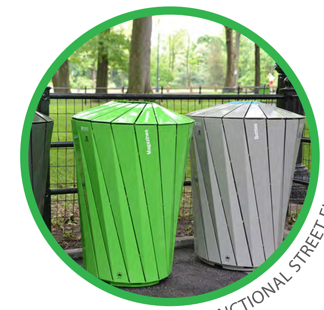
FUNCTIONAL STREET FURNITURE