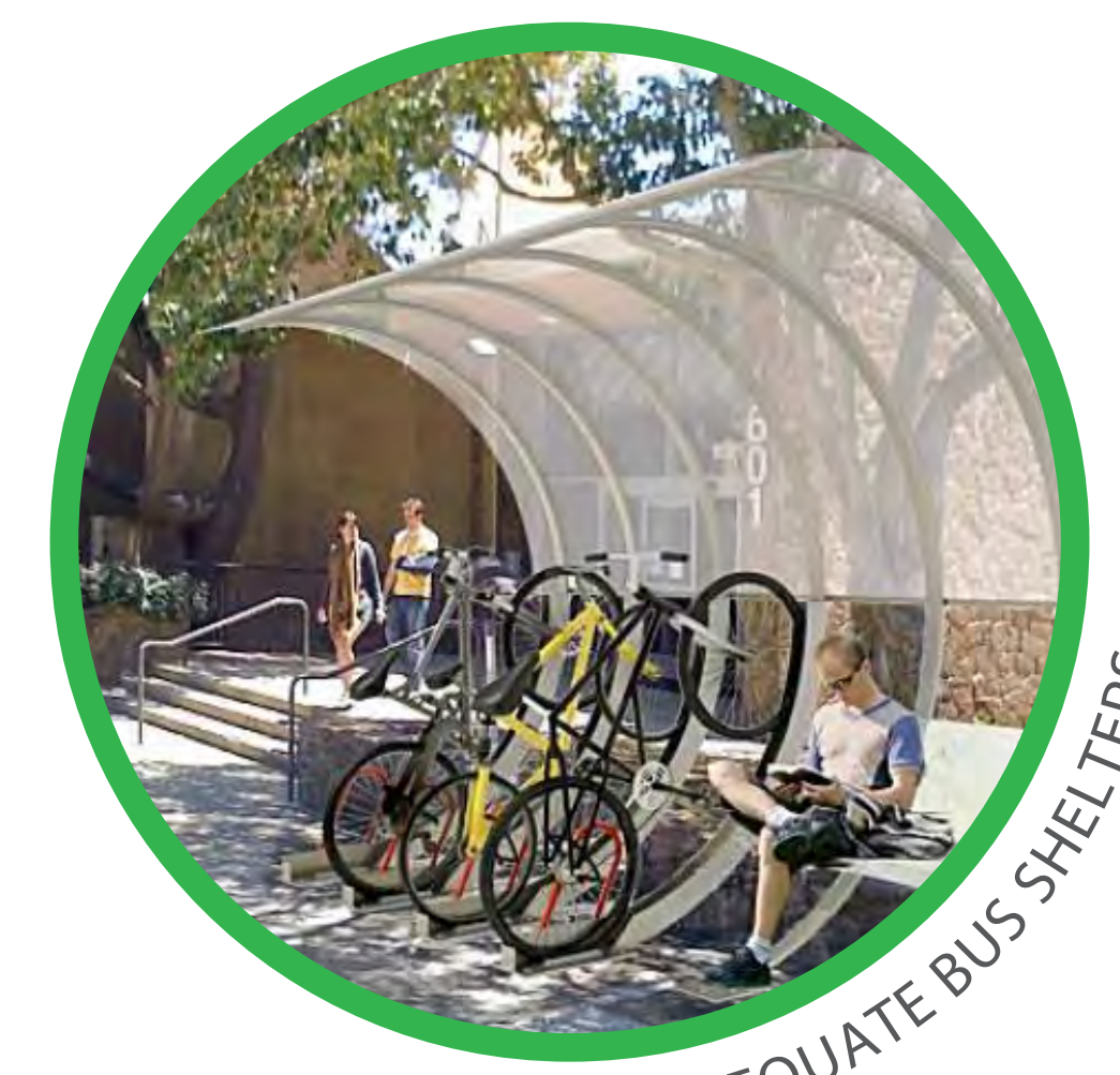
ADEQUATE BUS SHELTERS