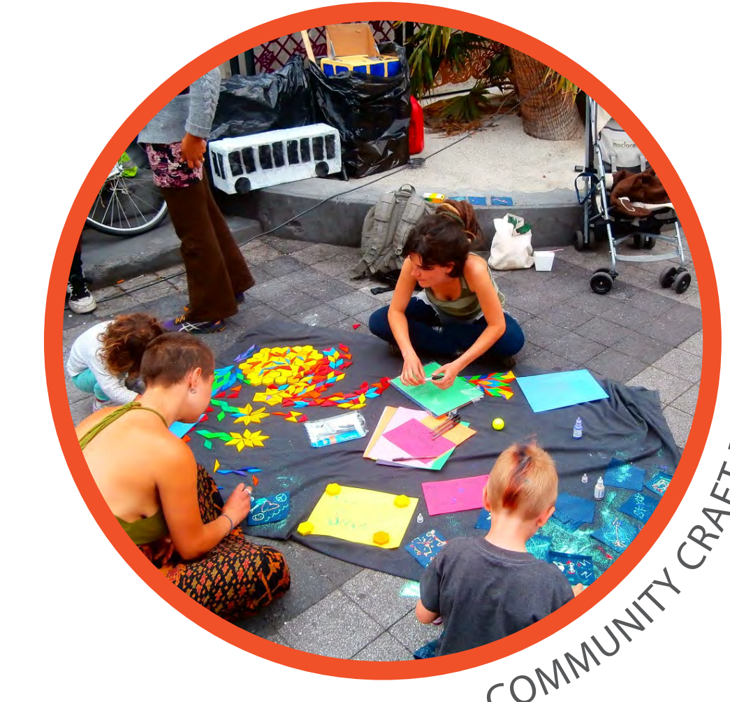
COMMUNITY CRAFT EVENTS