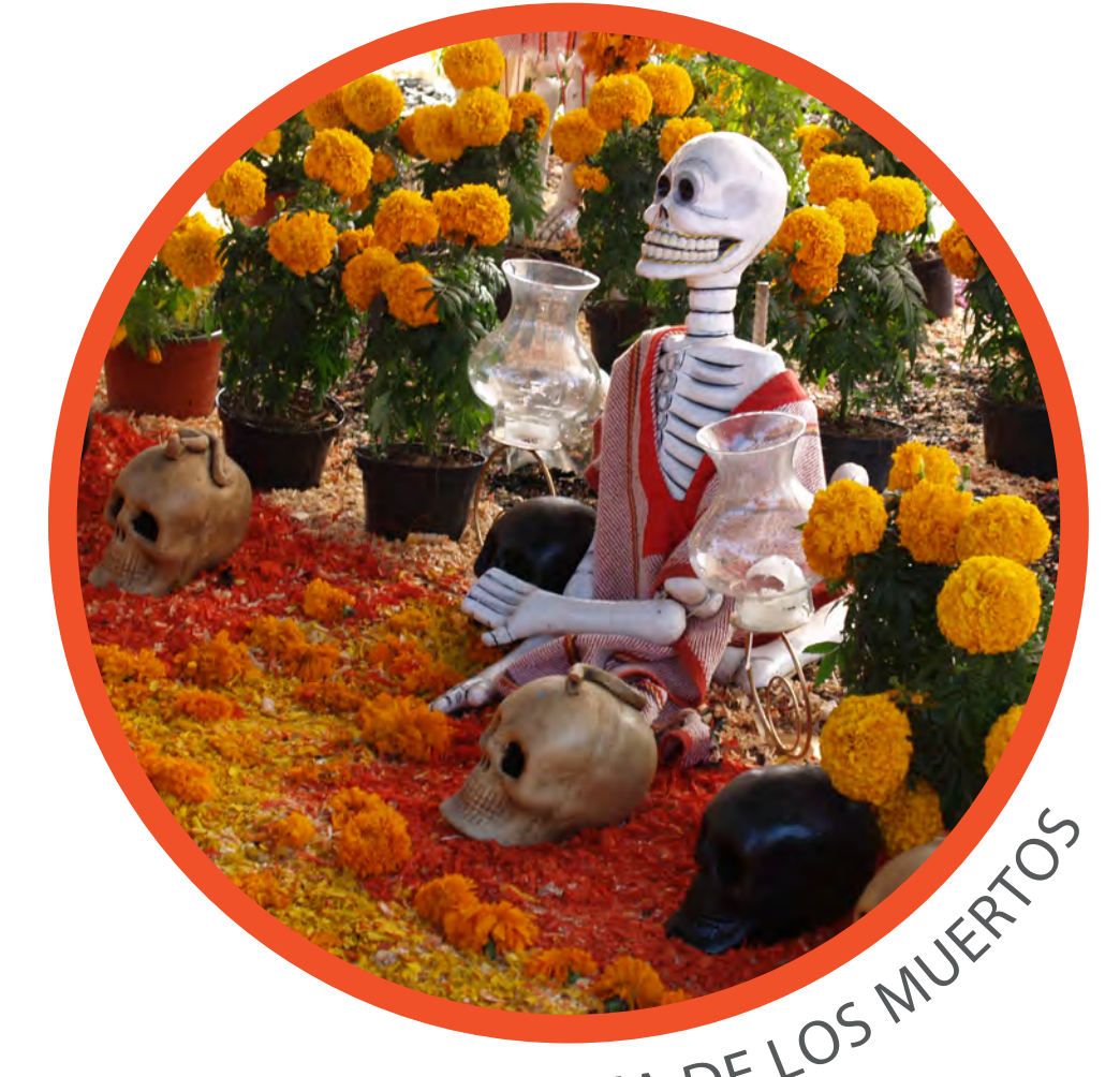
DIA DE LOS MUERTOS