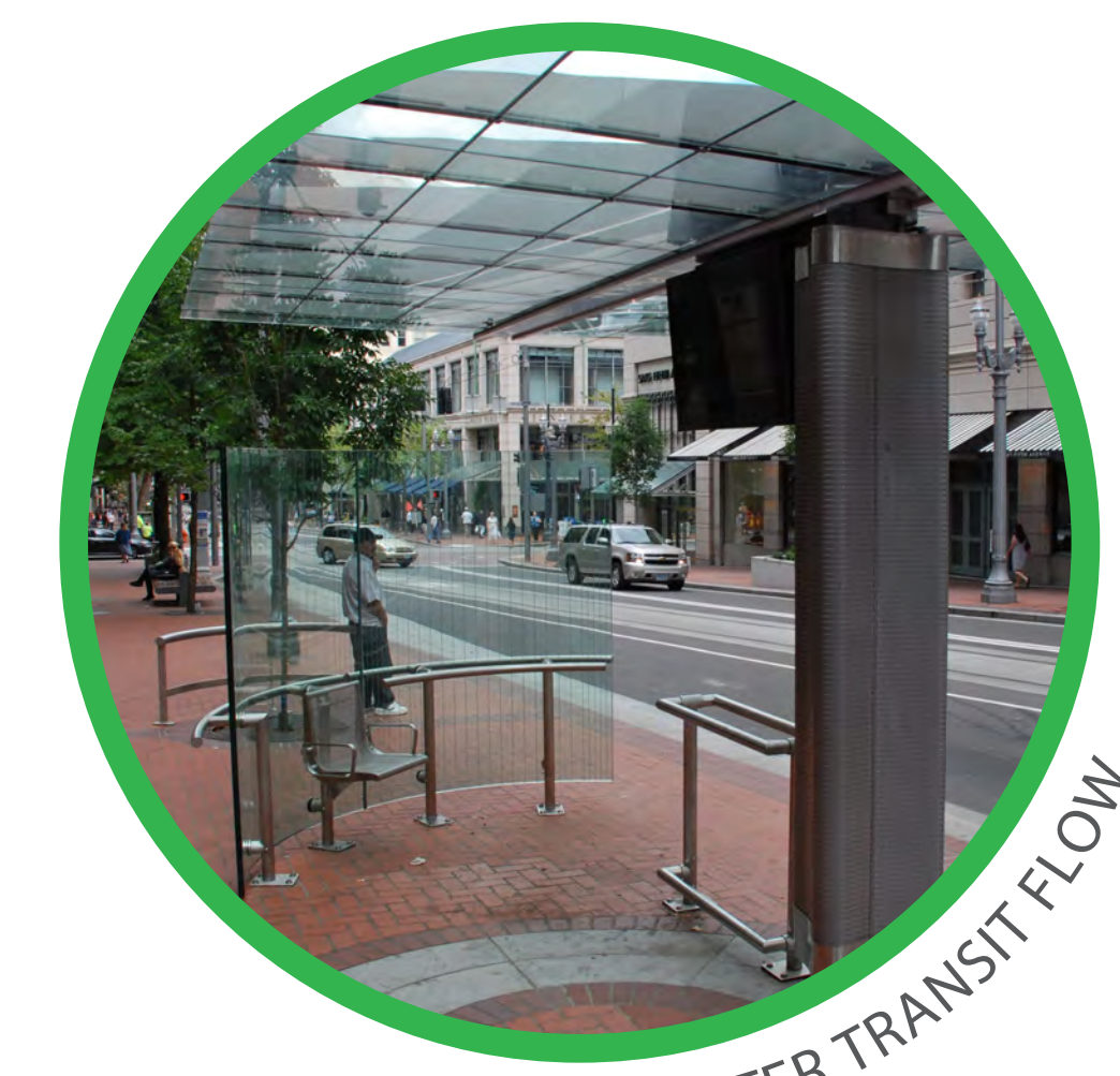
BETTER TRANSIT FLOW