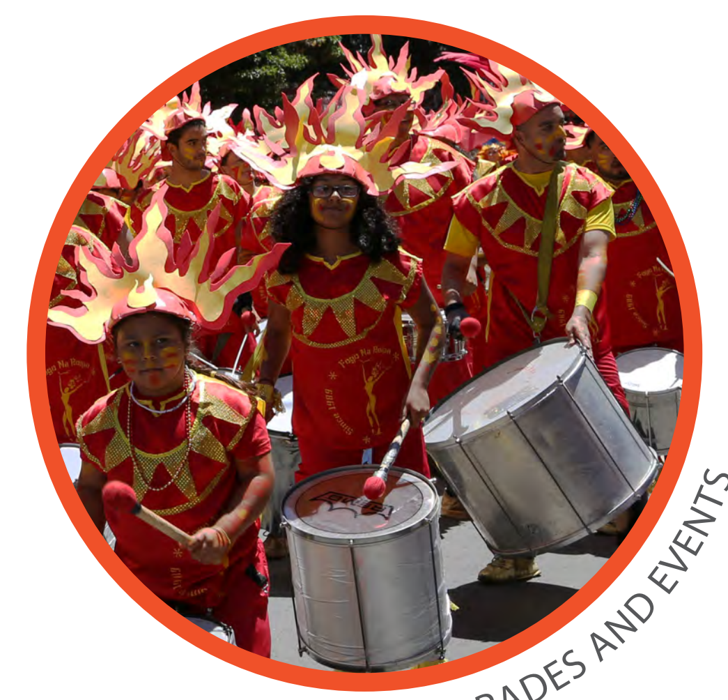
PARADES AND EVENTS

Public art is not only fundamental for a city, but also at the neighborhood level to encourage the members of a community to connect and express their personalities onto the public spaces they use every day. El arte público no es solamente fundamental para una ciudad, sino también al nivel de vecindario para incentivar a la comunidad para conectarse y expresar sus personalidades hacia los espacios públicos que utilizan diariamente.