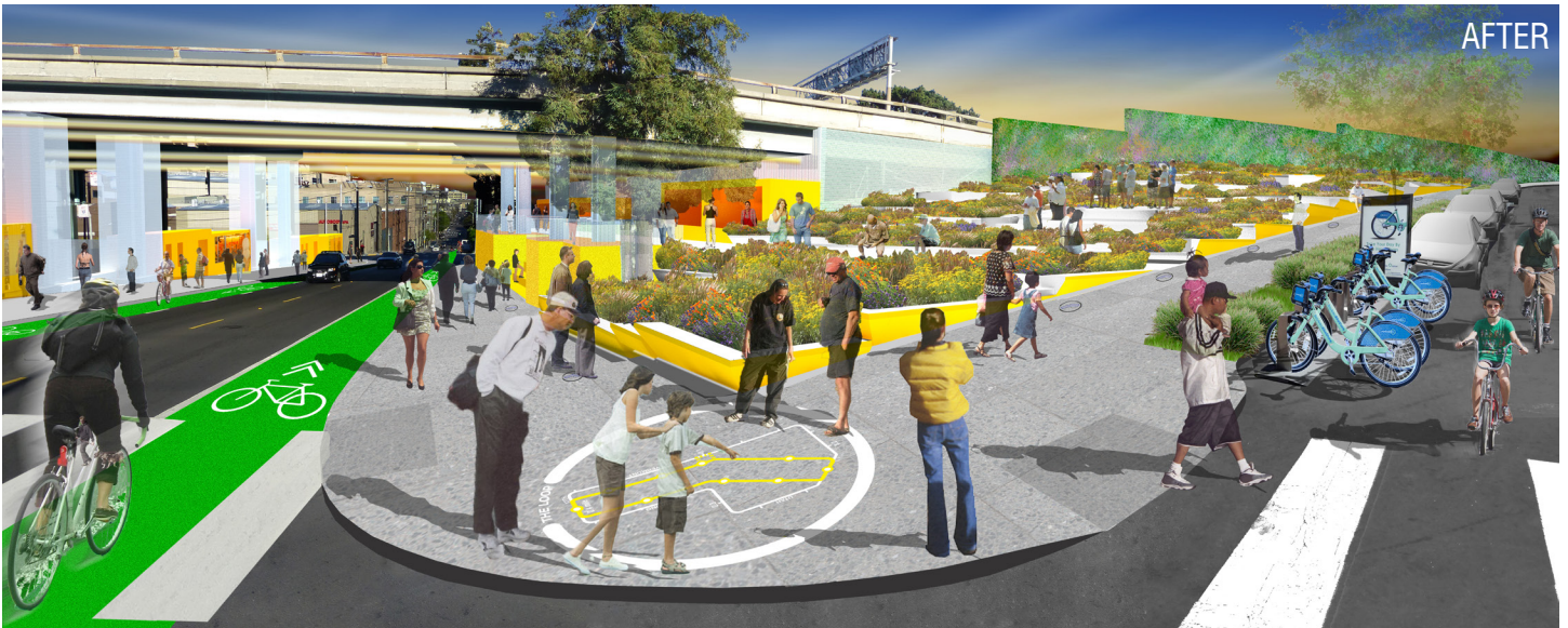
Intersection of 17th Street and San Bruno