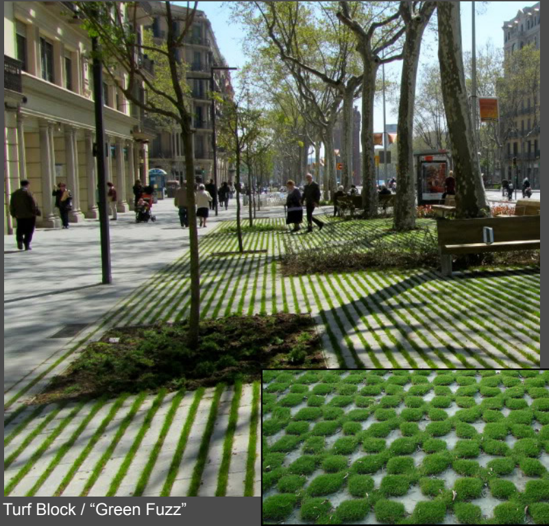
Turf Block / "Green Fuzz"